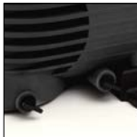
Double drain with easy opening (no tools required)