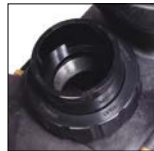
Unions kit included (50 or 63 mm)