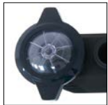
See-through Twist-Lock strainer cover