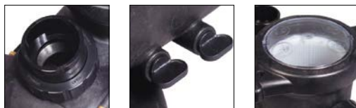
Easy-to-service design provides simple installation and maintenance